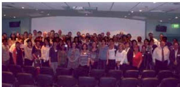
Participants at the Inaugural OzMRS Metastasis Symposium.

The parent society, MRS, is an international non-profit organisation dedicated to understanding the process of tumour metastasis on a cellular, molecular and biochemical