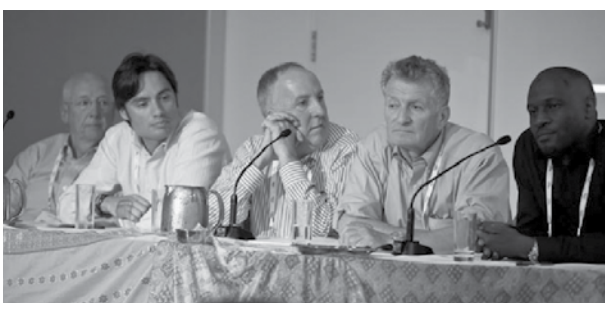
Developing Nations Workshop at the 2009 COSA ASM

There was a great deal of interest in Developing Nations Group at COSA this year with over 100 people attending the Workshop: "So you think you can help". Attendees identified areas that they have assisted with on a world map; suggested potential projects and nominated ways that COSA can enable greater participation by Australia in cancer control throughout our region.